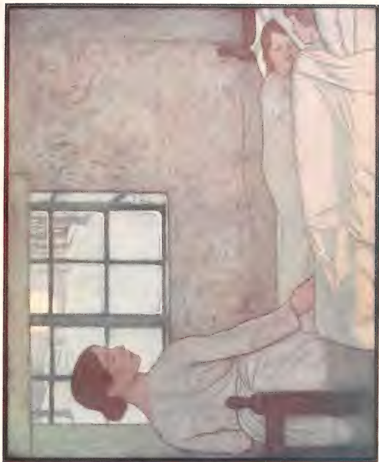
"PAUSED FOR A MOMENT TO REGARD THE SLEEPING CHILDREN"